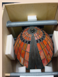
Tiffany-style lamp is braced with foam in a soft crate that is packed and padded inside another soft crate.