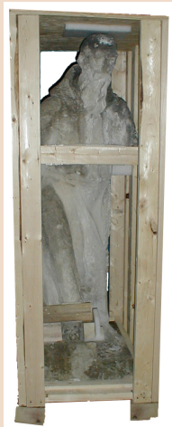
18th century stone monk sculpture crated for transport from NY to IL