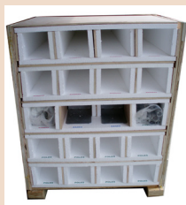
Reusable crate built for historic estate to ship their flag collection overseas

ARNOFF MOVING & STORAGE 800-633-6683 • sales@arnoff.com www.arnoff.com